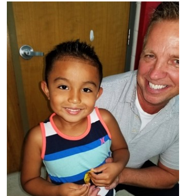
Sudlersville Elementary School Principal (Queen Anne's County) attends Parent Night for migrant families.