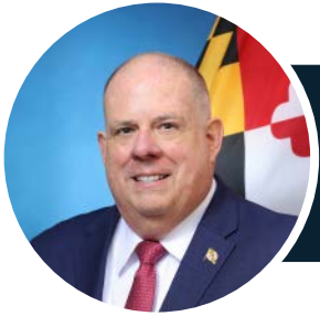
LARRY HOGAN Governor