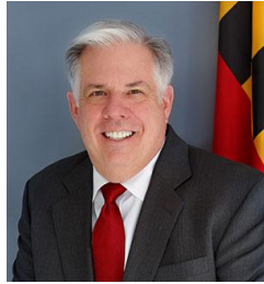
Larry Hogan Governor