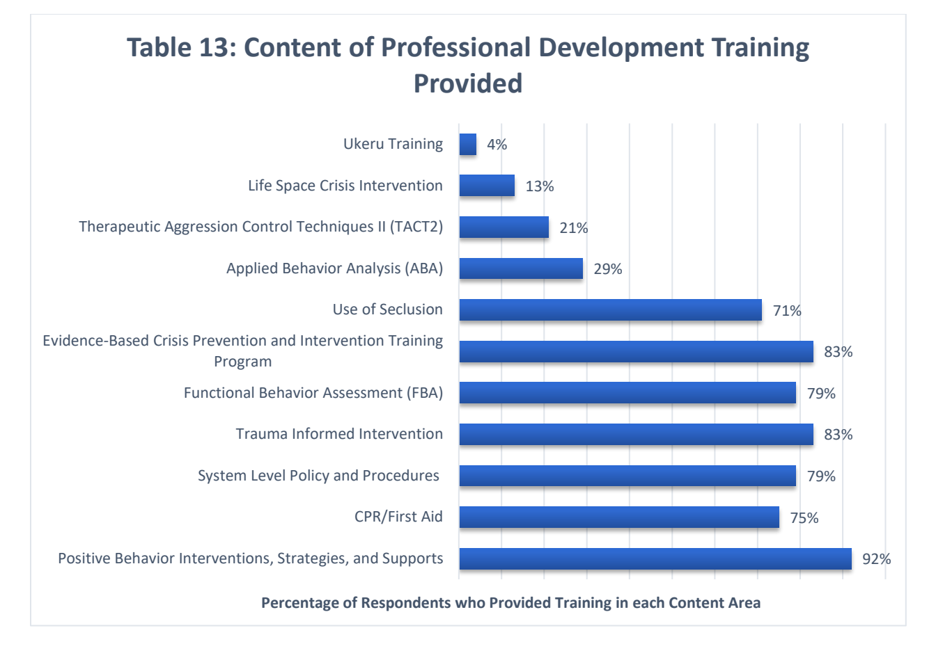
Table 13: Content of Professional Development Training Provided