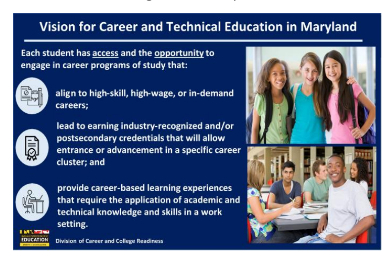
Figure 1: Vision for CTE

Equity and high quality CTE are also the cornerstones of the Maryland CTE Four-Year State Plan and Maryland State Plan for Postsecondary Education, which informed the Consolidated Perkins and MOA Monitoring Plan development.