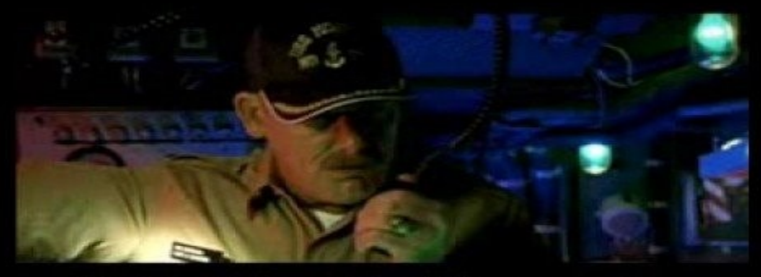
This is Captain Hancock, you will divert your course... Over