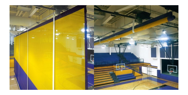
Figure 5: Electric Vertical Retractable Curtain

9. Electric vertical retractable curtain: Also referred to as a motorized roll-up divider curtain or partition, that can be retracted vertically to the ceiling or extended downward partitioning the space, such as a gym into two sections (example in Figure 5 below). Often these curtains can be quite heavy and require a motorized lifting mechanism.