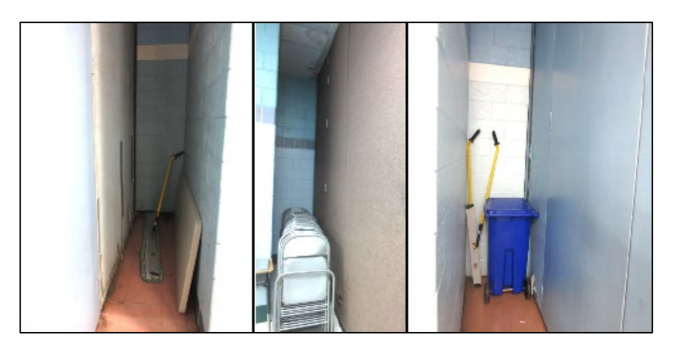
Figure 10: Electric Horizontal Retractable Partition pockets misused for storage