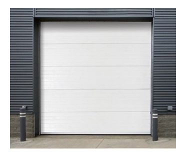
Figure 4: Electric Overhead Sectional Door

8. Electric overhead sectional door: Consists of one or multiple interlinked panels, such as used in a garage door (example in Figure 4 below). It is a kind of fixed partitioning system with single or multiple panels hung from above that opens or closes vertically in a track by an electric motor.