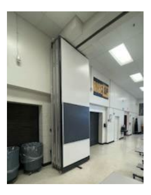
Figure 1: Electric Horizontal Retractable Partition