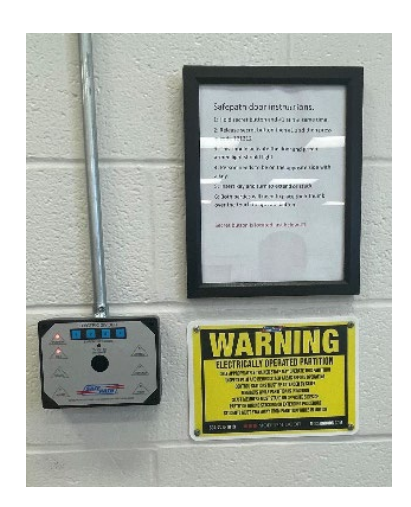
Figure 9: Control Station and Operating Instructions for Electric Vertical Retractable Curtain