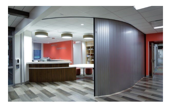
Figure 2: Electric Horizontal Coiling Door

6. Electric horizontal coiling door: A type of floor-to-ceiling partitioning system that moves horizontally (example in Figure 2 below) using a motor. It can be automatic in the case of fire shutters or operated by a key system on control panels.