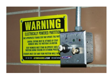
Figure 8: Two Key-Operated Control Station