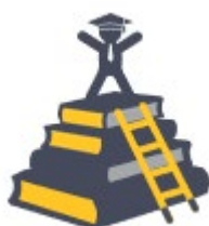
Core of Knowledge Hours